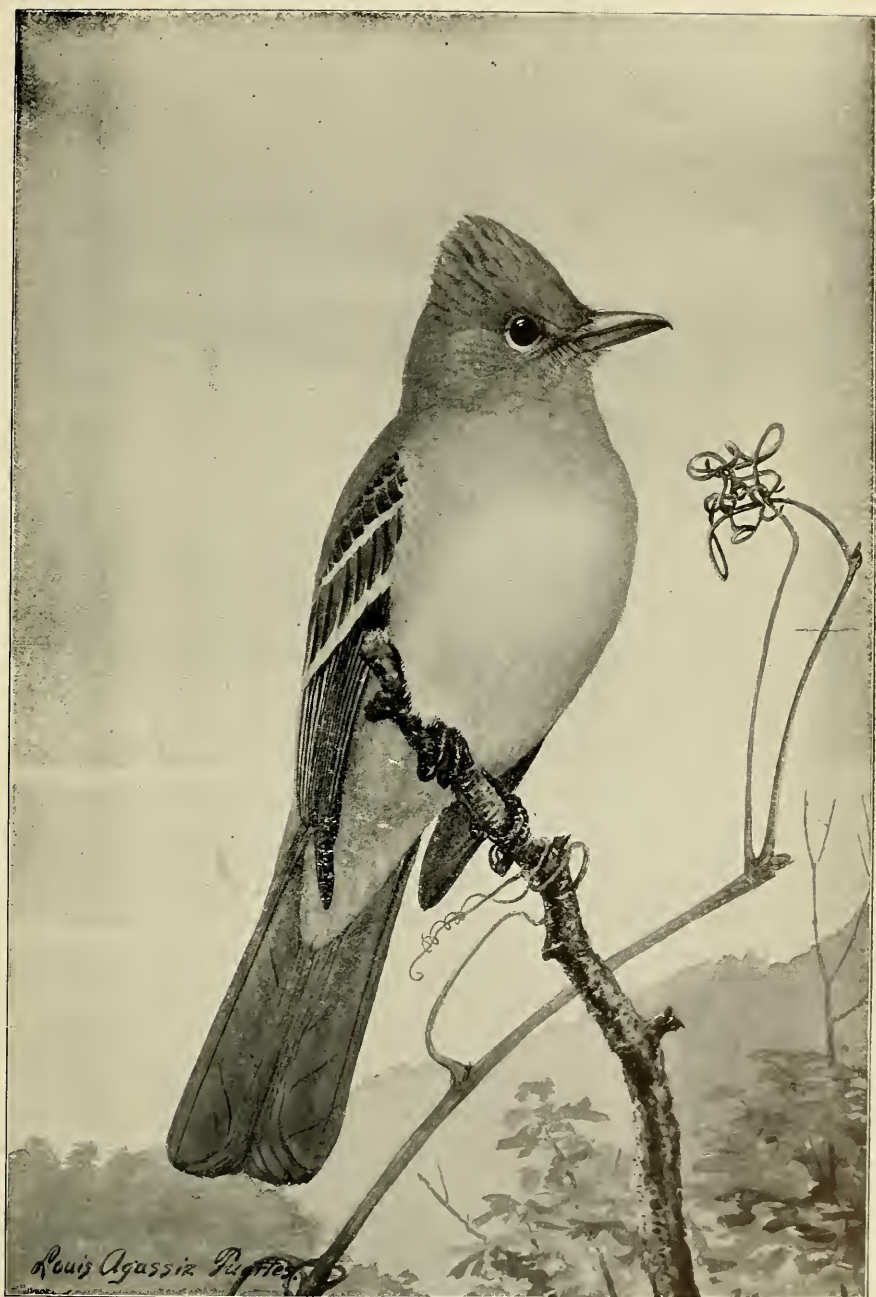
NORTHERN CRESTED FLYCATCHER